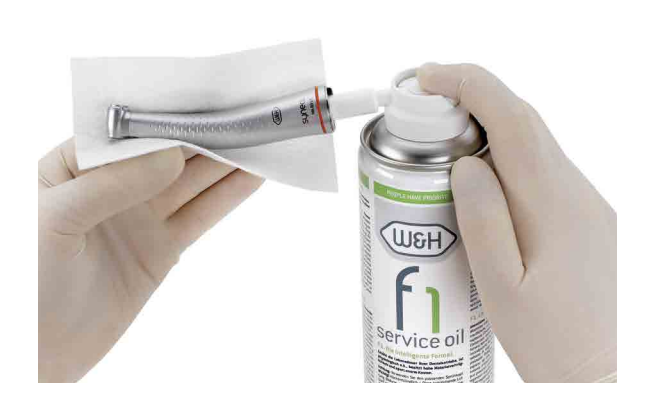
W&H Service Oil F1 in the MD-400 spray can.