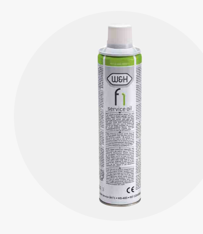
Oil spray can Type MD-400 Contents 400 ml

Diagrams, symbol photos, additional equipment and the content of illustrated accessories do not form part of the scope of supply.