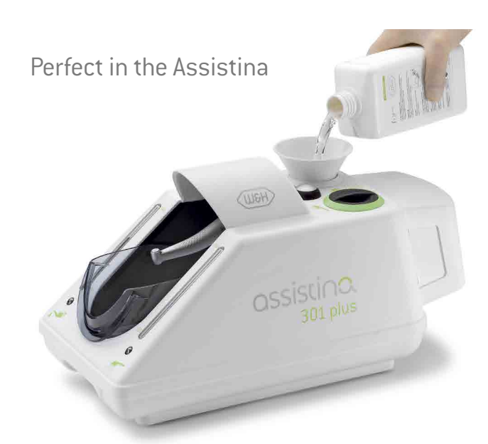
W&H Service Oil F1 in the MD-500 bottle for use in the Assistina.

W&H dental drives achieve top speeds of up to 390,000 r.p.m. F1 provides excellent lubrication