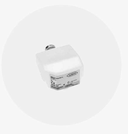
Cartridge for Assistina 3x3 / 3x2 Type MD-200 Contents 200 ml

Order your Service Oil F1 through your dental supplier. Suitable spray caps can befound on the Internet at wh.com